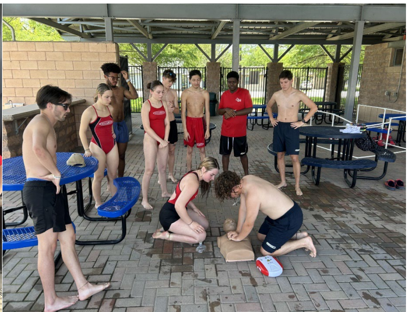
PARD Welcomes to 2024 Seasonal Aquatics Staff!