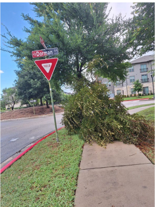
landscaping at the library