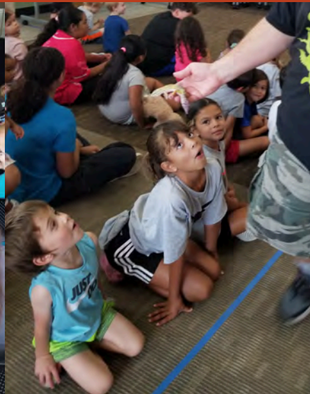
AUSTIN REPTILES SHOW!