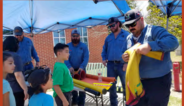
PEC MEET A LINE WORKER PORCH PARTY