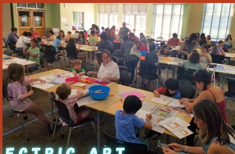
SUMMER STEAM LAB- ELECTRIC ART