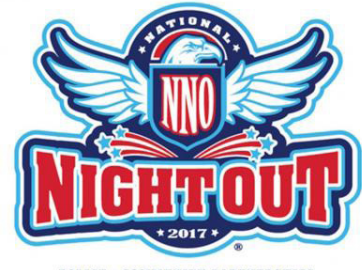
POLICE . COMMUNITY PARTNERSHIPS

neighborhood's National Night Out event! This year in Texas it takes place October 3. Contact Kyle Police Department if you would like officers to stop by your event.